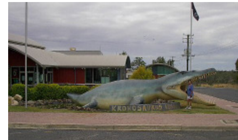
Kronosaurus Corner - Richmond