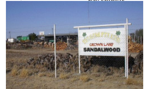
Sandalwood Factory - Richmond World's most valuable wood.

BELOW This lead block weighs 4 tonnes and contains 10 kg of silver. We saw two carriages of these on the freight train to Townsville-the rest carried copper ore. The lead blocks are then shipped to the MIM,s plant in the UK where the silver is extracted for European sale.