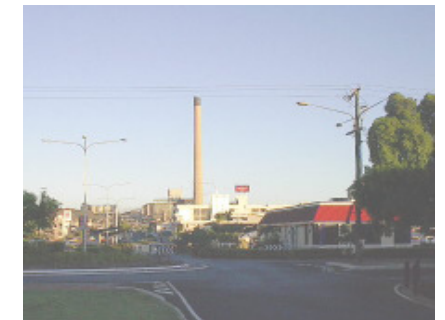
Mt Isa Mine -Right on the West side of City