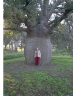
Roma's Biggest Bottle Tree