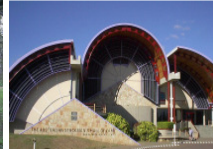
Australian Stockmans Hall of Fame-Longreach