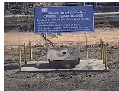
Lead & Silver Block Processed at Mt Isa Mines